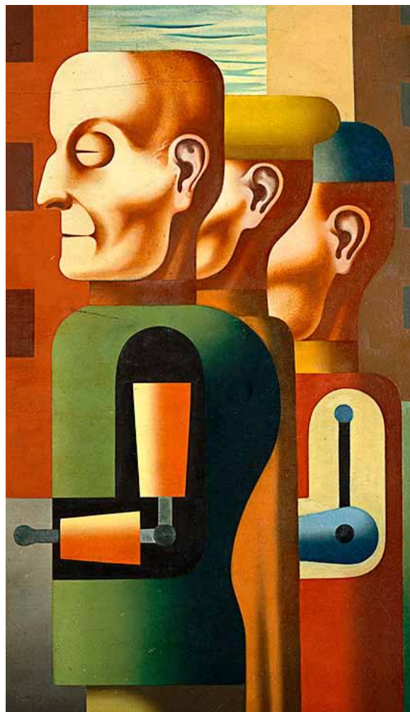
Heinrich Hoerle Three invalids c.1930 (detail) Private collection

In an era of chaos came an explosion of creativity – experimental, provocative and utterly compelling.